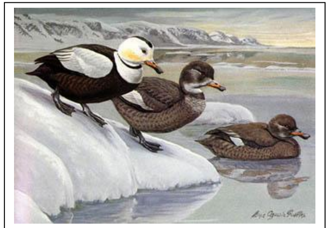
Labrador Duck by Louis Agassiz Fuertes in 1922–1926. Male (left), juvenile male (center), adult female (right). This image is in the public domain because its copyright has expired. This applies to the United States and those countries with a copyright term of life of the author plus 70 years.

Too bad these organizations were not in place in the early 19th century. In 1878 the Labrador Duck (pictured below) was the first bird to go extinct in the United States. There were probably never many of them to begin with. Reports from the time say that this duck was unwary of man. Except for domestic fowl and pond Mallards, most ducks fly off when humans approach—smart move. ♦