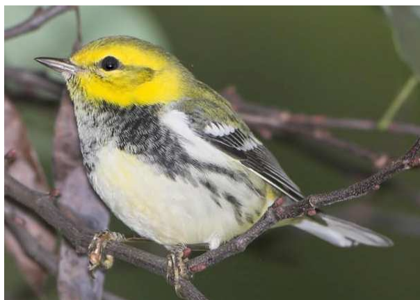
Black-throated Green Warbler

This should prepare us for what's in store during the next several weeks here in Missouri and Illinois. Many migrating warblers are being seen already, so grab your binoculars and get out there between the raindrops!! ◆