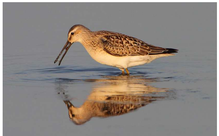
Heron Pond at Riverlands